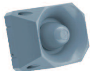
Asserta Maxi Grey